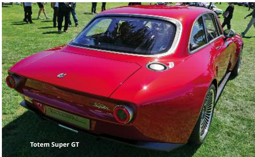
Totem Super GT