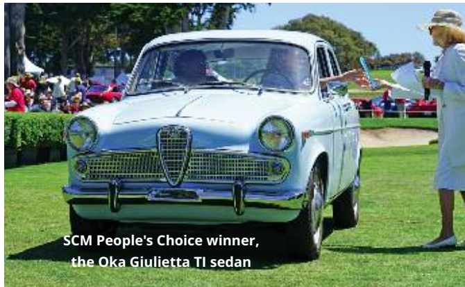
SCM People's Choice winner, the Oka Giulietta TI sedan