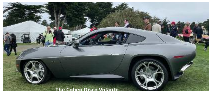
The Cohen Disco Volante.