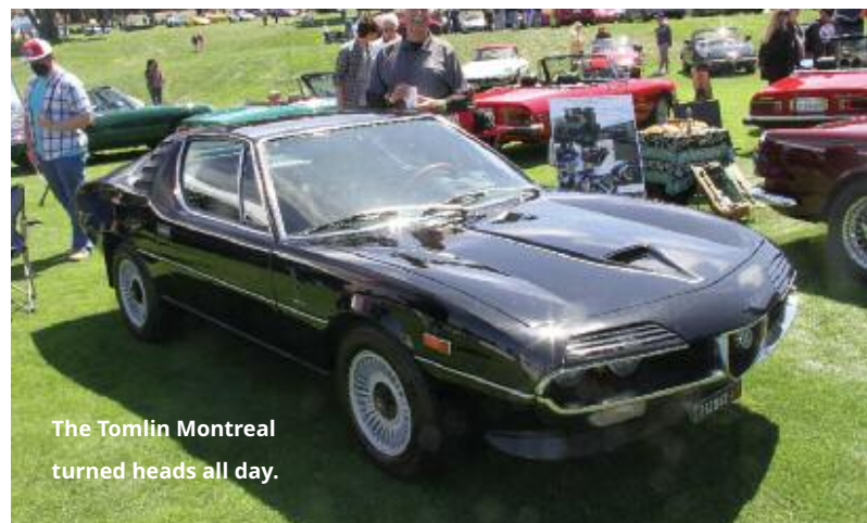
The Tomlin Montreal turned heads all day.