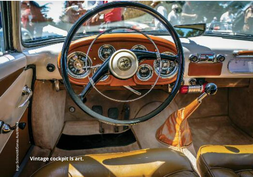
Vintage cockpit is art.