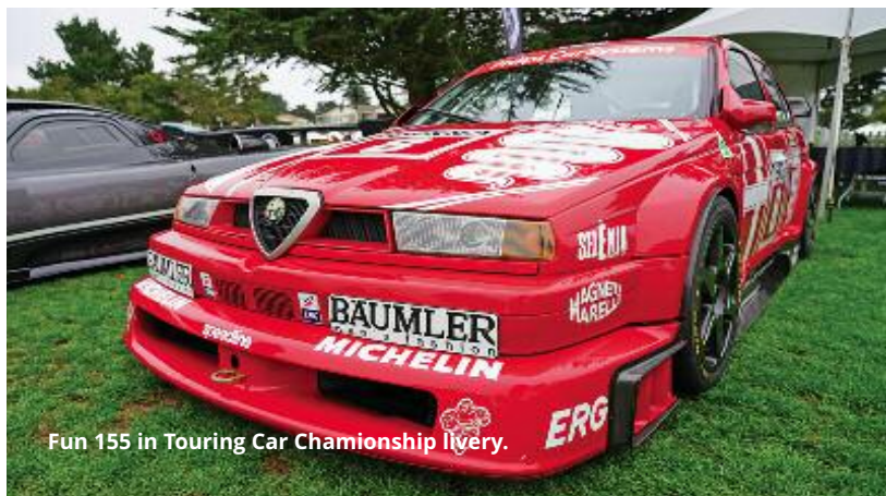
Fun 155 in Touring Car Chamionship livery.