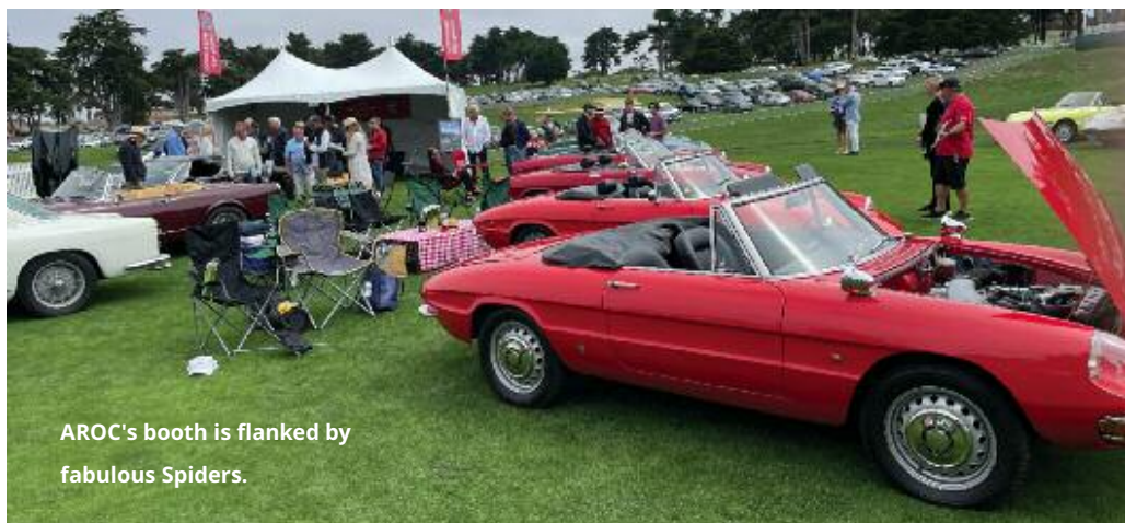
AROC's booth is flanked by fabulous Spiders.