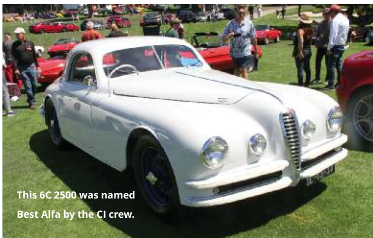
This 6C 2500 was named Best Alfa by the CI crew.