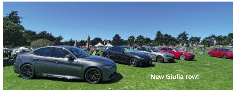
New Giulia row!