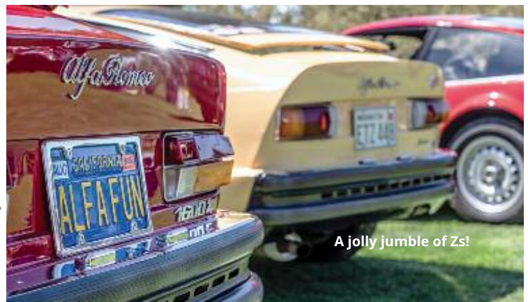
A jolly jumble of Zs!