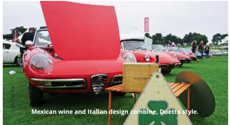
Mexican wine and Italian design combine, Duetto style.